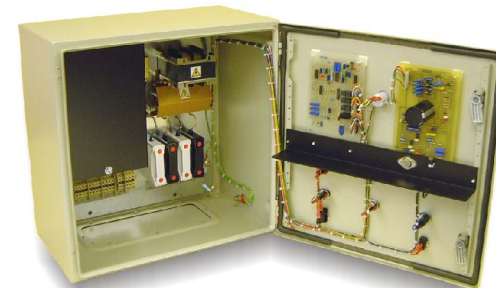
Battery pack 2No. P4293