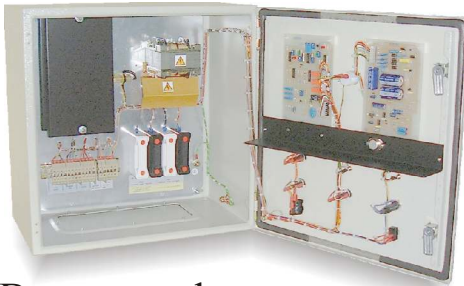
Battery pack 2No. P4295