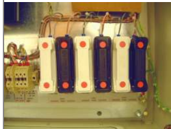
Battery pack 2No. P4291