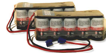
Battery pack 2No. P4291